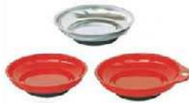
Magnetic Tool Holder