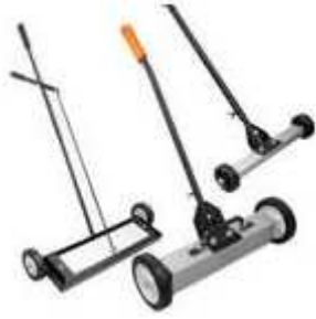
Magnetic dish / Magnetic plate